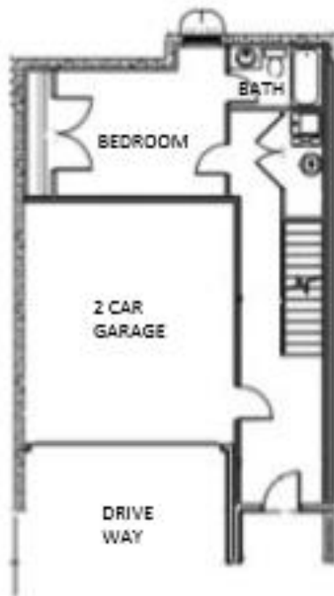
GROUND FLOOR - UNIT A