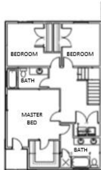
TOP FLOOR - UNIT A