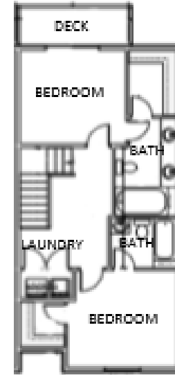
TOP FLOOR - UNIT B